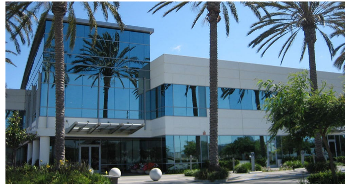
Equinix LA4 IBX data center exterior

To learn more about interconnection opportunities in Los Angeles, visit the Explorer feature within Equinix Marketplace .