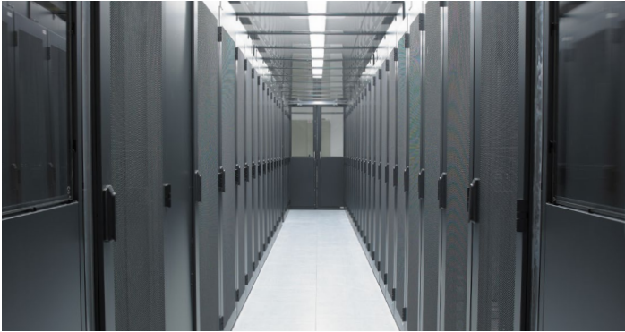
Equinix FR2 IBX data center interior