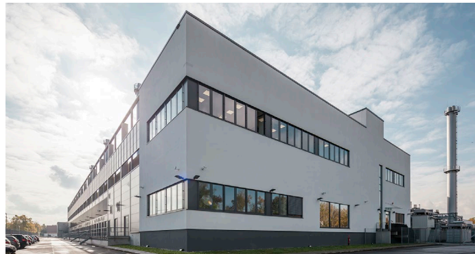
Equinix FR2 IBX data center exterior

The Equinix metro International Business Exchange™ (IBX®) data centers consist of six buildings with 59,050+ square meters (635,000+ square feet) of colocation space. Each of our Frankfurt facilities is compliant with key international standards including ISO 9001: 2008 for quality management systems and ISO 27001 for information security management systems.