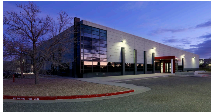
Equinix DE2 IBX data center exterior

To learn more about interconnection opportunities in Denver, visit the Explorer feature within Equinix Marketplace .